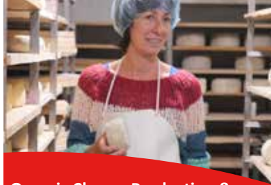
Organic Cheese Production & Goat Breeding Quesería artesanal El Cabrero de Bolonia