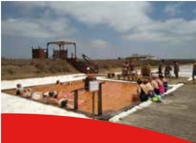
Traditional Salt Pans Salinas de Chiclana