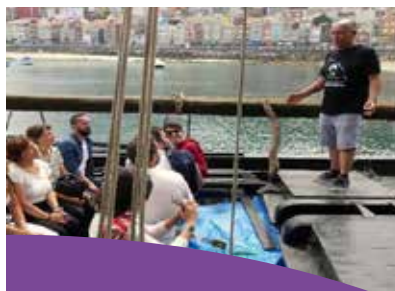
A Guarda, River Port Tour Buguina Turismo Cultural & Amodo Turismo & Ruta 552