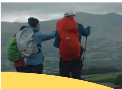
Welsh Cultural Walks Trigpoint Adventure