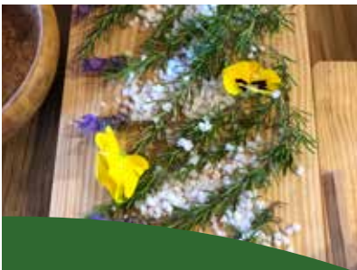
The Gourmet Tour Salinas Experience