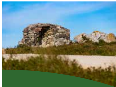
Travel to the Past Jeep Tour Salinas Experience