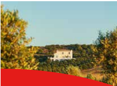
Olive Oil Exhibition Centre Mareoleum, Centro de Interpretación del Olivar