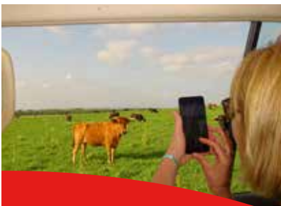
Bull & Livestock Watching Tours Aprende de Toros