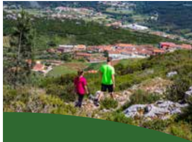
Trails and Caves Cooperativa Terra Chã