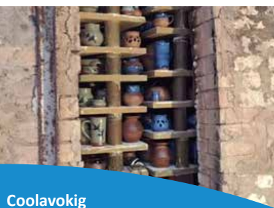
Coolavokig Handcrafted & Woodfired Pottery Robb Bradstock