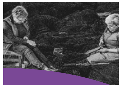
A Guarda, Sea Port Tour Buguina Turismo Cultural & Amodo Turismo & Ruta 552