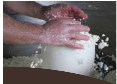
Discover Cheese World in Tresviso Javier Campo