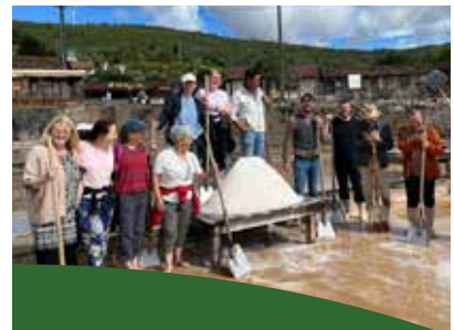
The Salt Experience Salinas Experience