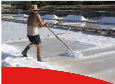
The Inland Roman Salt Pans of Iptuci Salinas Romanas de Iptuci