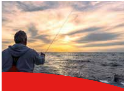
A Fishing Trip with Local Fishermen Pesca Turismo Tarifa