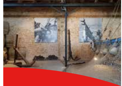
Cadiz Fishing Heritage & Gastronomy Cadiz Atlántica