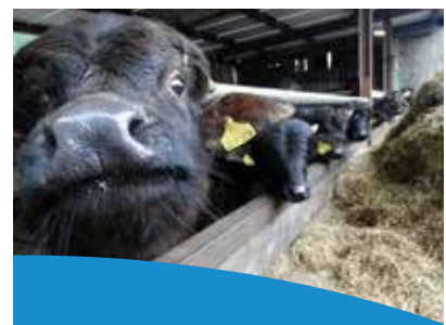
Tour & Taste Macroom Buffalo Mozzarella Farm Ó Tuama Tours