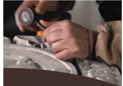
Carved in Stone at Vicente Diestro's Vicente Diestro