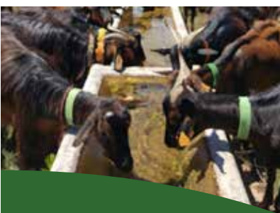
A Morning with a Shepherd Cooperativa Terra Chã