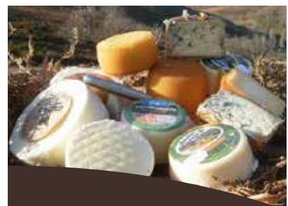
The Taste of Cheese in Quesería Pendes Pedro Velarde