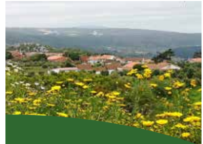
Explore Chãos Cooperativa Terra Chã